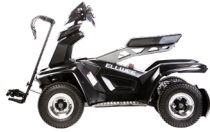
EW8004 ELLWEE X GOLF Dental White (EW0021) Deep Blue Metallic (EW0030) Supermatt Black (EW0011)