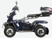
EW8004R ELLWEE X RESORT Dental White (EW0021) Deep Blue Metallic (EW0030) Supermatt Black (EW0011)