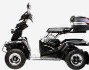
EW8200R ELLWEE EASY RESORT Dental White (EW0021) Deep Blue Metallic (EW0030) Supermatt Black (EW0011)